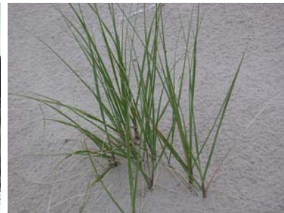
American Beachgrass, or 'Marram' grass ( Ammophila breviligulata )