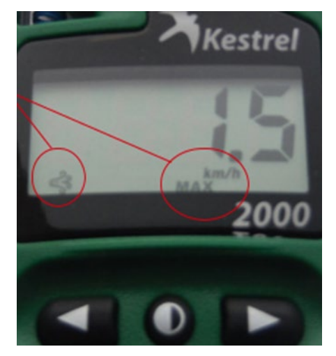
Maximum wind speed Wind graphic + Km/Hr. + MAX