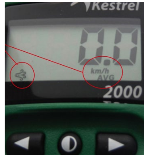
Average wind speed Wind graphic + Km/Hr. + AVG