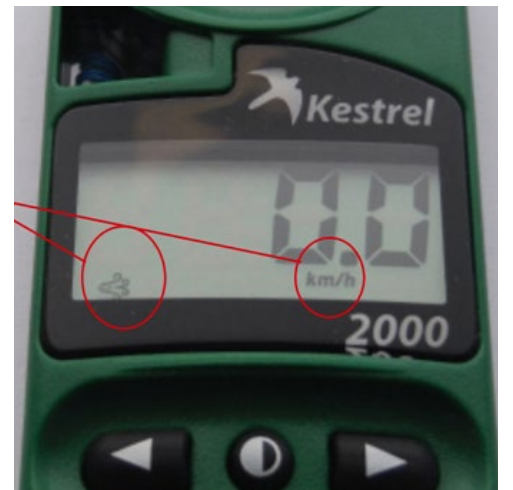
Current Wind Speed Wind graphic + Km/Hr.