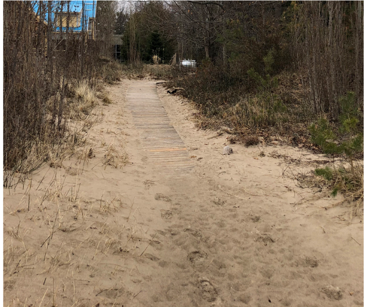
Photo 1: Example of a straight and wide beach pathway which is prone to erosion.

As an alternative, consider sharing a path to the beach with your neighbours. Not only will you be minimizing negative impacts on the dunes, you can share summer holiday stories while you make your way through the dunes to enjoy the lake.