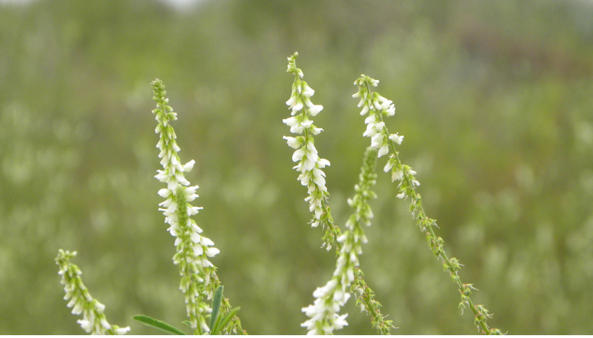
White Sweet Clover, an invasive species.

The Lake Huron Coastal Centre has published a plant guide, " Lake Huron Coastal Dune Plants: The GOOD, the BAD and the UGLY " which can be a helpful tool.