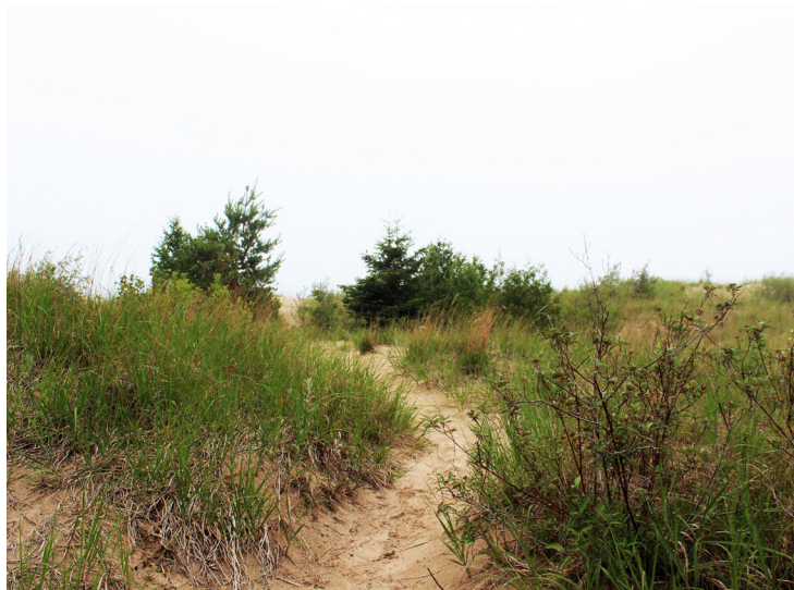
Photo 2: Example of an "S" shaped pathway which prevents large scale erosion.