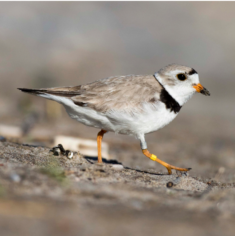
Female Piping Plover